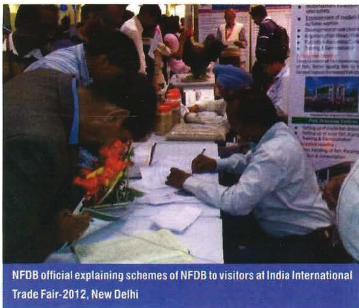
NFDB official explaining schemes of NFDB to visitors at India International Trade Fair-2012, New Delhi