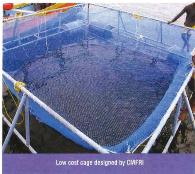
Low cost cage designed by CMFRI