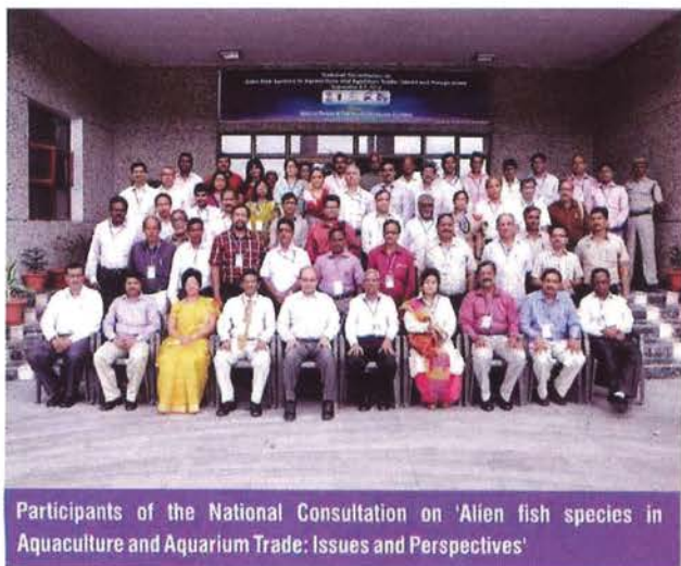
Participants of the National Consultation on 'Alien fish species in Aquaculture and Aquarium Trade: Issues and Perspectives'

A National Consultation on “Alien fish species in Aquaculture and Aquarium Trade: Issues and Perspectives” was held at National Bureau of Fish Genetics Resources (NBFGR), Lucknow on September 6-7, 2012 in collaboration with the Dept. of Animal Husbandry, Dairying & Fisheries (DAHDF), Govt. of India; National Fisheries Development Board (NFDB); Hyderabad and Aquatic Biodiversity Conservation Society (ABCS), Lucknow. In the National Consultation, about 80 Scientists, Technocrats, Government officials, development workers, ornamental fish breeders, entrepreneurs, policy makers, academicians and NGOs participated and discussed various issues related to fish introduction, aquaculture and aquarium fish trade development on sustainable basis.