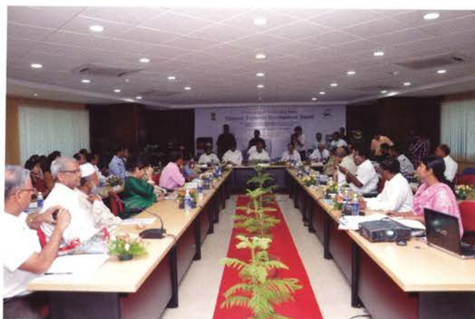
Chairman and Vice Chairman of Governing Body of NFDB conducting 7th meeting of GB