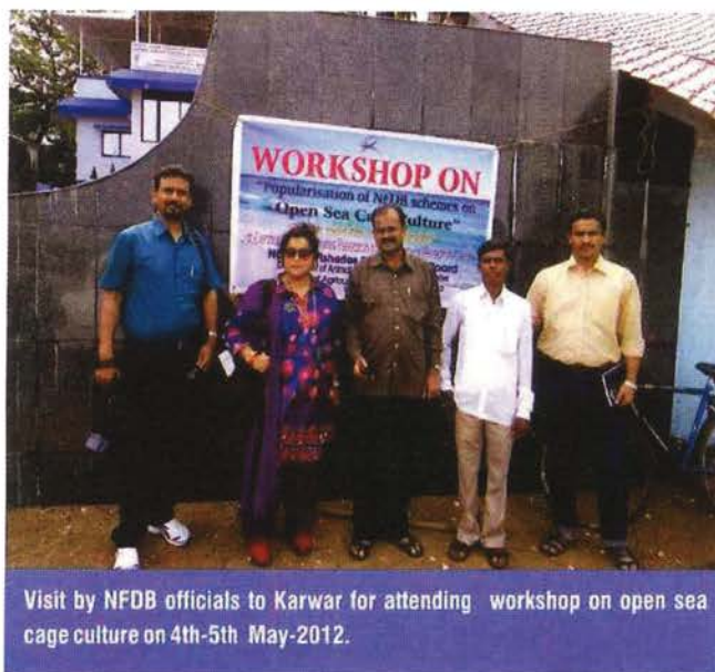
Visit by NFDB officials to Karwar for attending workshop on open sea cage culture on 4th-5th May-2012.

To popularize the NFDB schemes on open sea cage culture, a two days workshop was organized at Karwar Research Centre of CMFRI on 4th and 5th October 2012. State fisheries officials and fishers from Maharashtra, Karnataka, West Bengal, Andhra Pradesh, Goa and Odisha have attended the programme. The participants were explained about the cages, mooring technology, stocking, feeding technology and rearing protocols in detail.