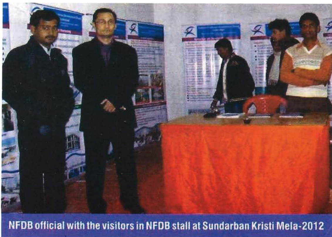
NFDB official with the visitors in NFDB stall at Sundarban Krishi Mela-2012