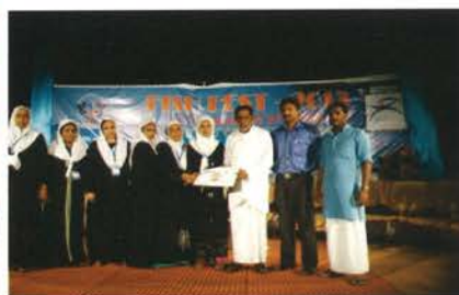
Visitors in Fish festival, 2013